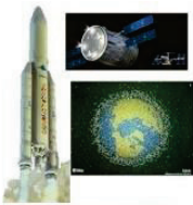
ARIANE, SOYUZ, VEGA ATV Space Surveillance