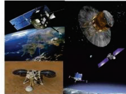
MYRIADE (Demeter, Parasol, Essaim, Picard, Elisa, Taranis, Microscope, ...) ROSETTA, GAIA, InSight ...