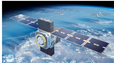
2022 Space Van for EXOTRAIL